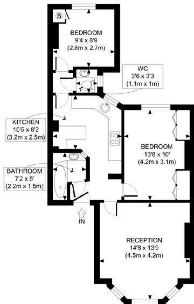
FIRST FLOOR GROSS INTERNAL FLOOR AREA 605 SQ FT