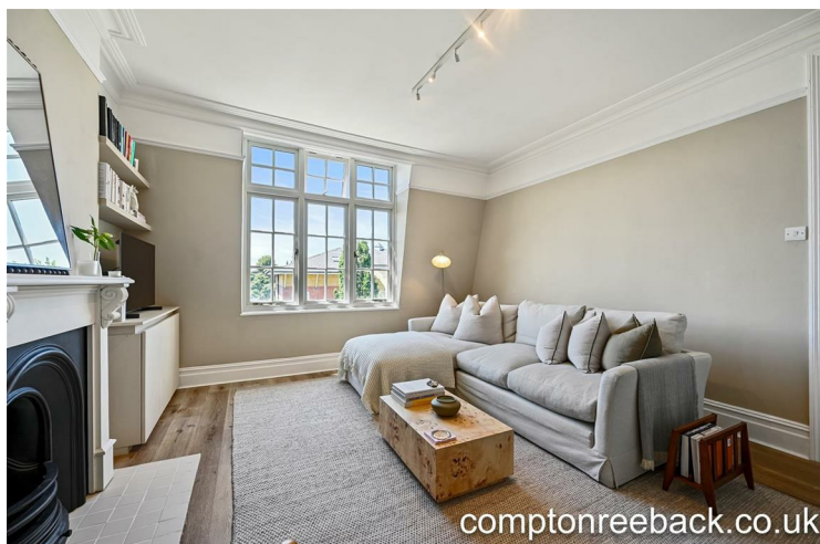
Reception - 2nd shot