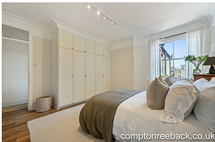
Bedroom 2nd shot