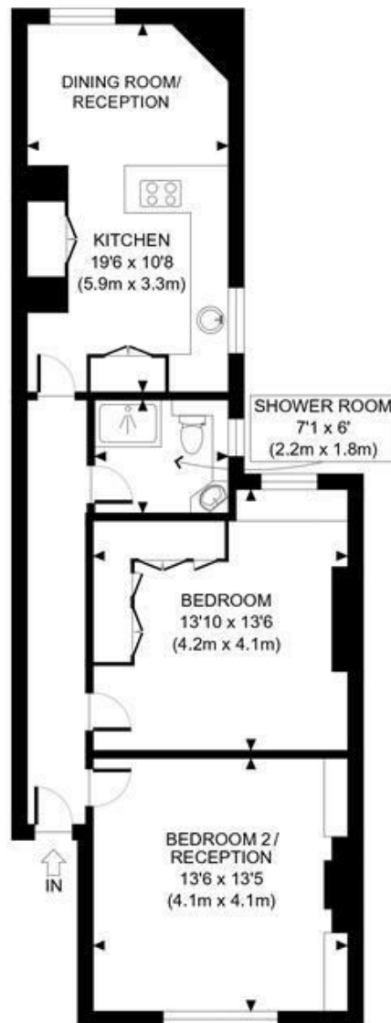
RAISED GROUND FLOOR GROSS INTERNAL FLOOR AREA 699 SQ FT

APPROX. GROSS INTERNAL FLOOR AREA: 699 SQ FT/ 65 SQM