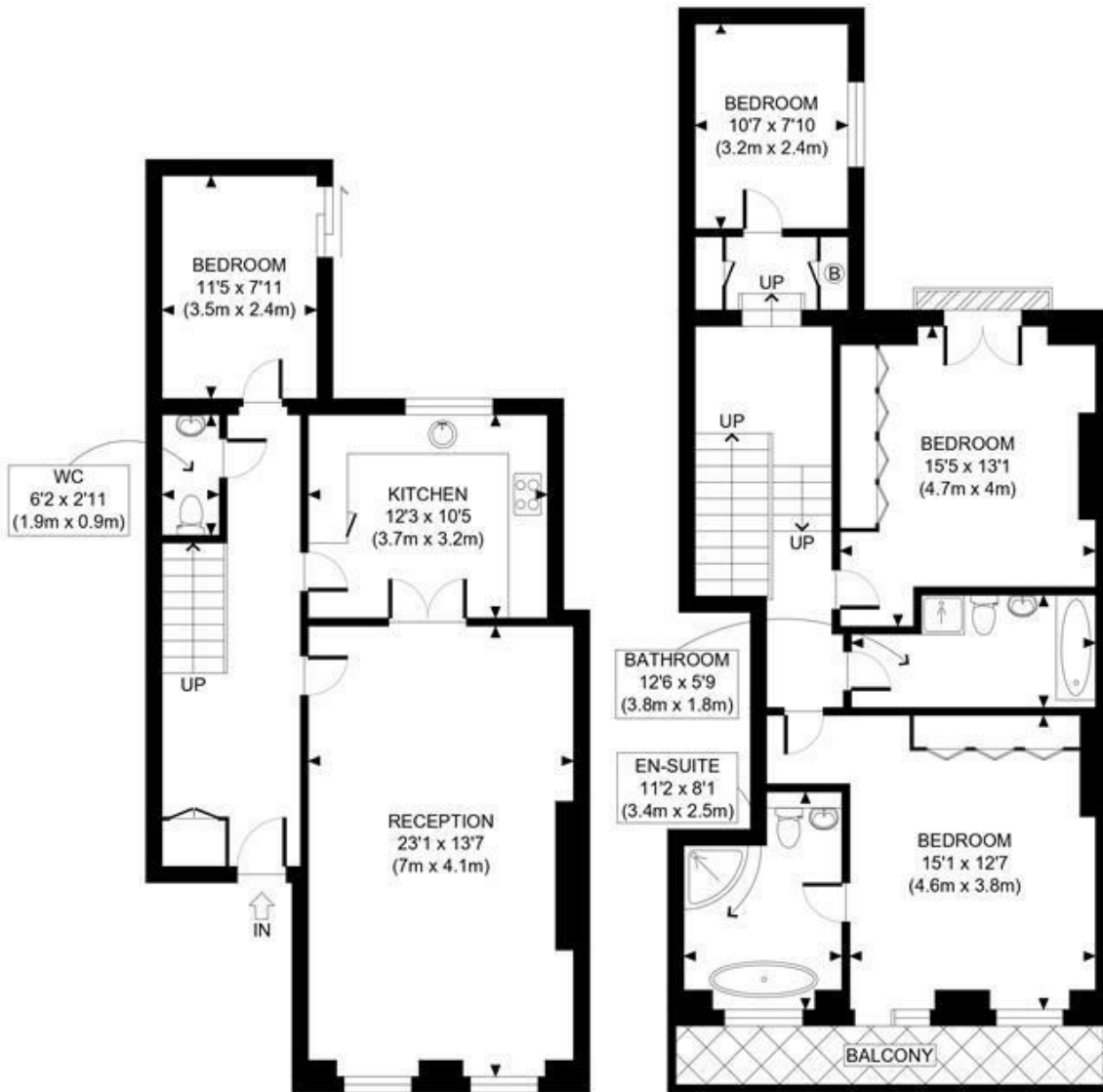
GROUND FLOOR GROSS INTERNAL FLOOR AREA 717 SQ FT