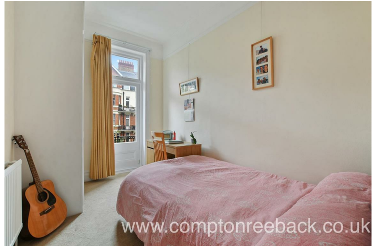
Bedroom 2; Double (Double)