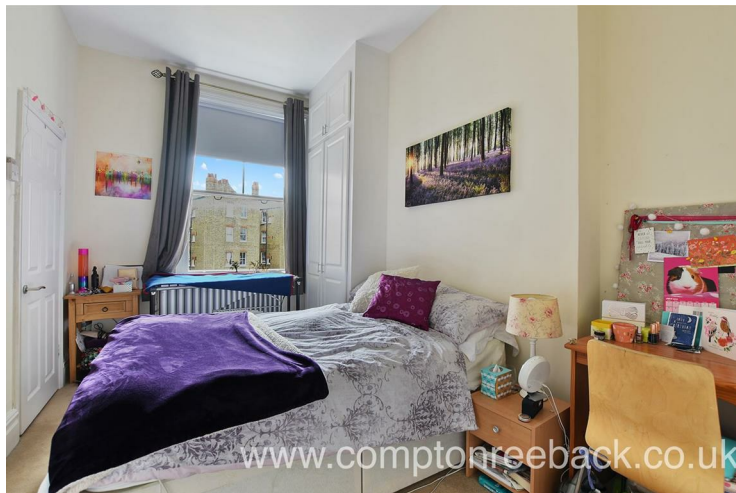
Bedroom 1; Double (Double)