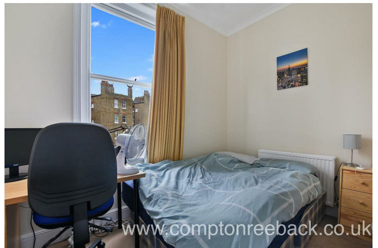
Bedroom 3; Sml Double (Sml Double)