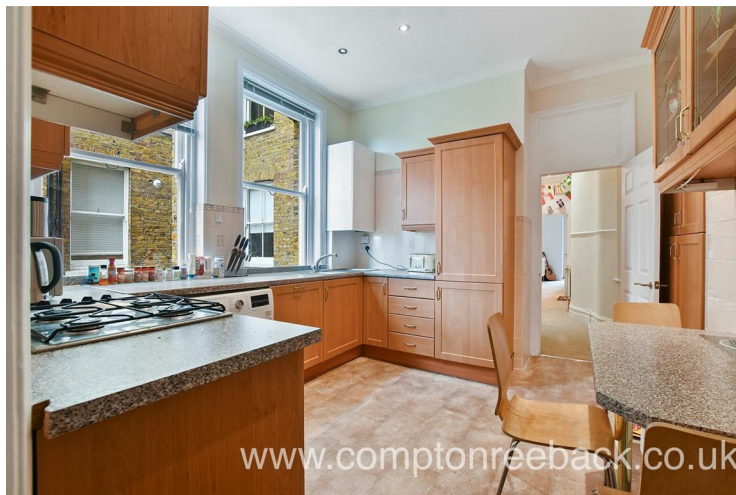
Kitchen; Eat In Fitted Kitchen (Eat In Fitted Kitchen)