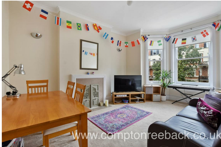
Reception; Good Size (Good Size)