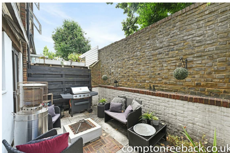
Garden / patio